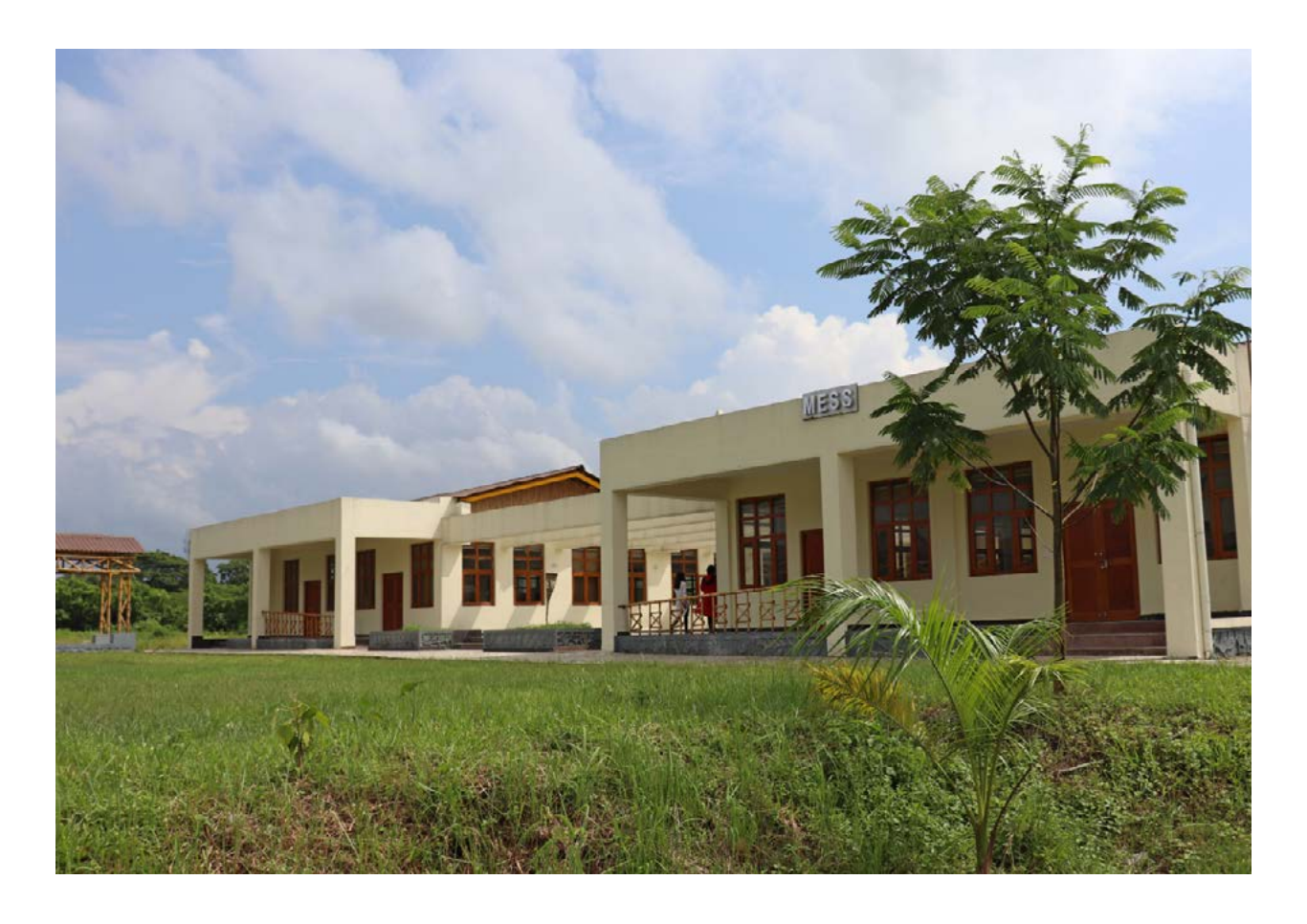
Hostels for students