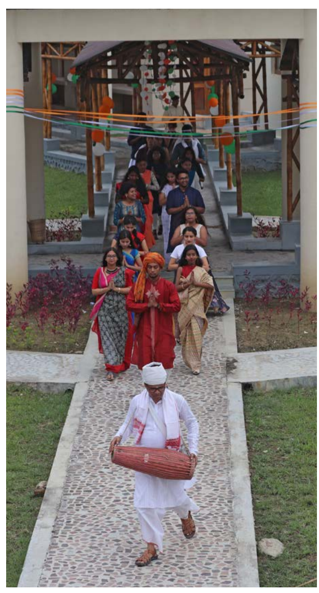
Faculty and Students participating in Independence day celebration at NID, Assam.