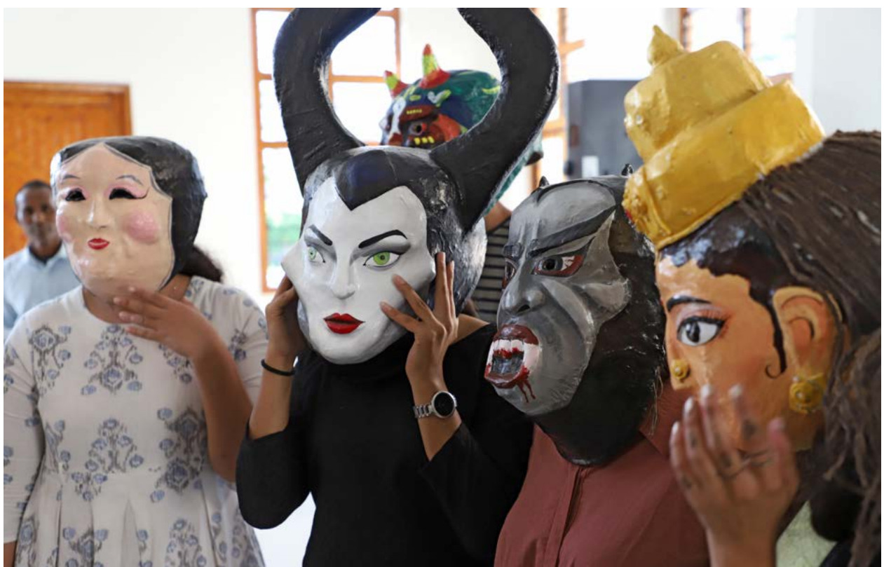
October 2019, Design week was organized at NID, Assam with fruitful outcomes.