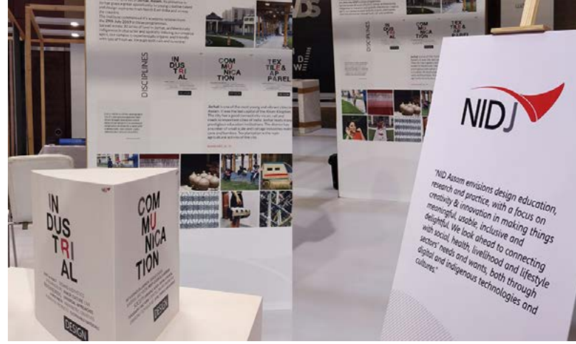
NID, Assam participated at World Design Organization (WDO) Hyderabad in October 2019