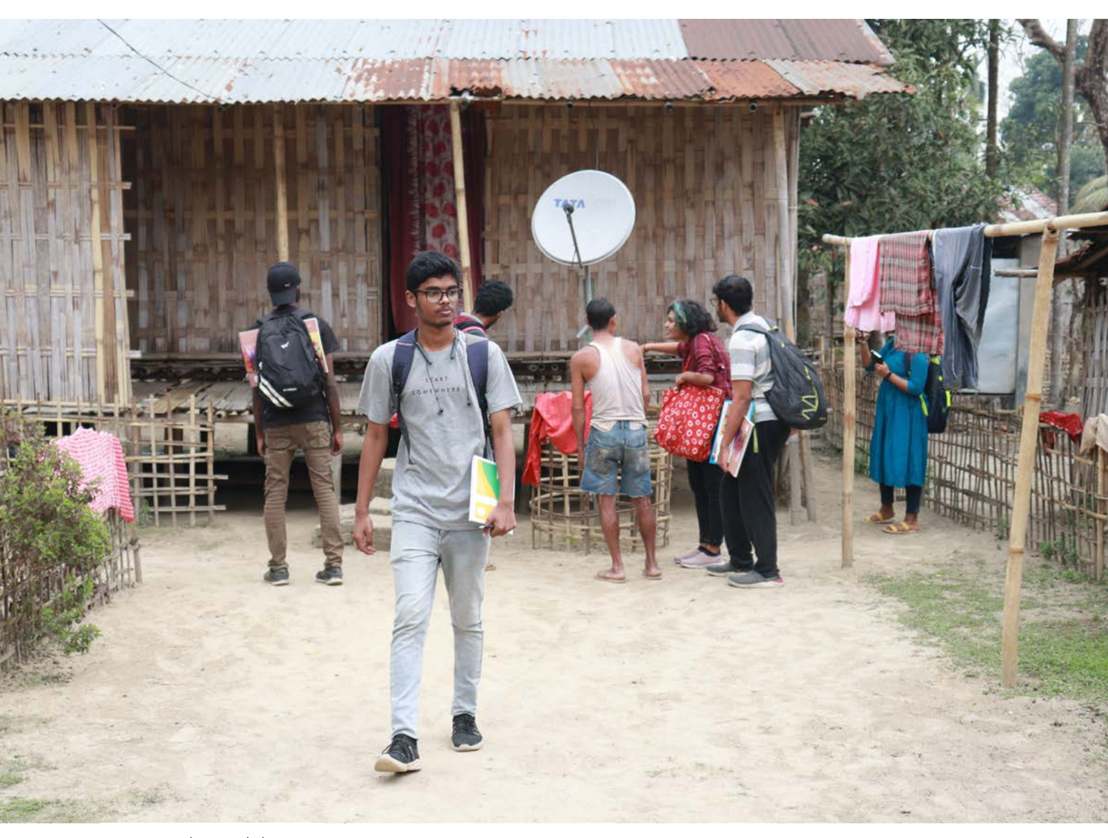
▲ ABOVE Students on their way to their designated sites of study and exploration. Course: Environmental Perception.

esign is a creative, analytical and a holistic human centric process leading to a meaningful and desirable outcome. Design learning is a hands-on, minds-on engagement—experiential, reflective and developing objective and subjective sensibilities.