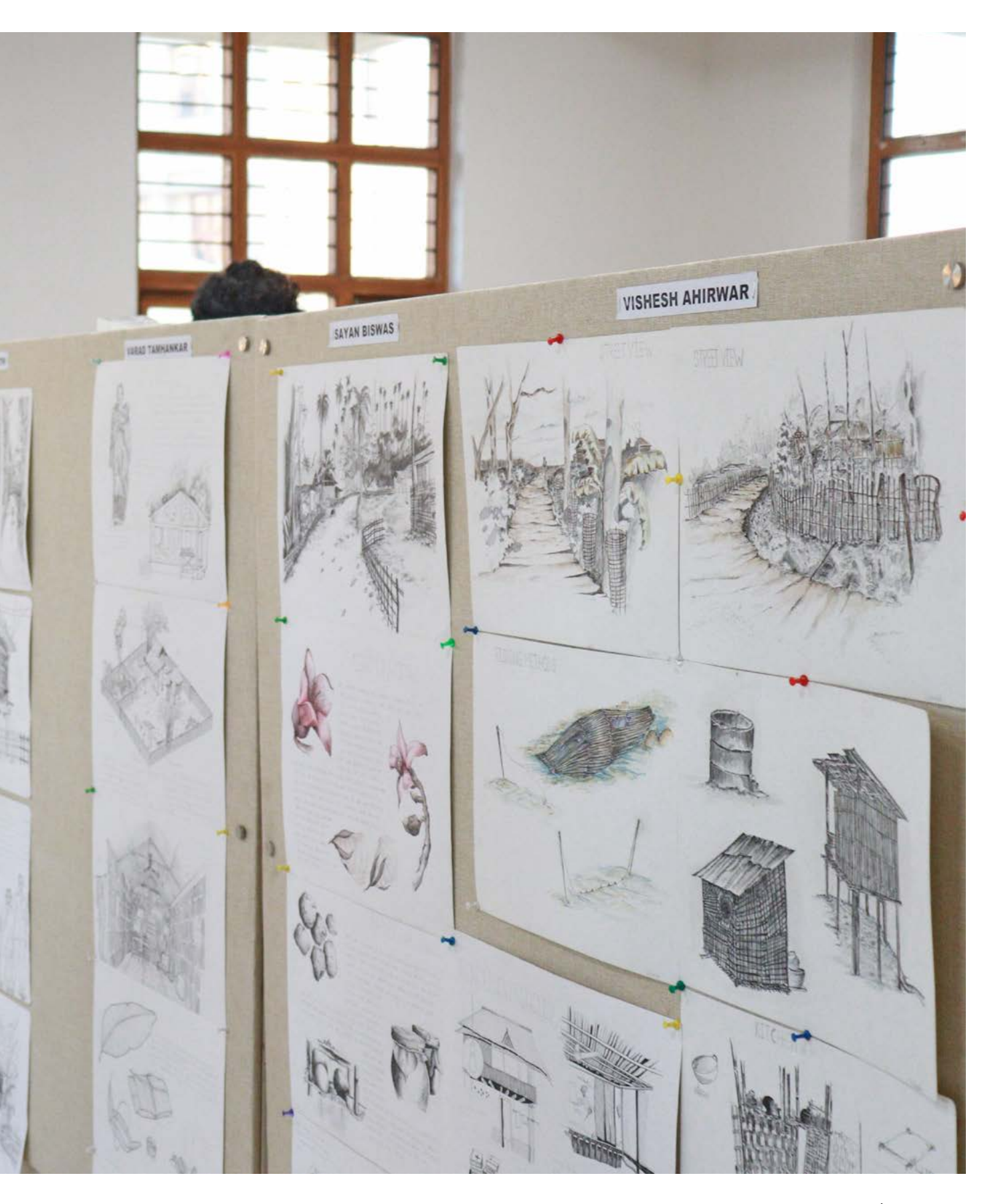
▲ ABOVE Student's works exhibition at display room.