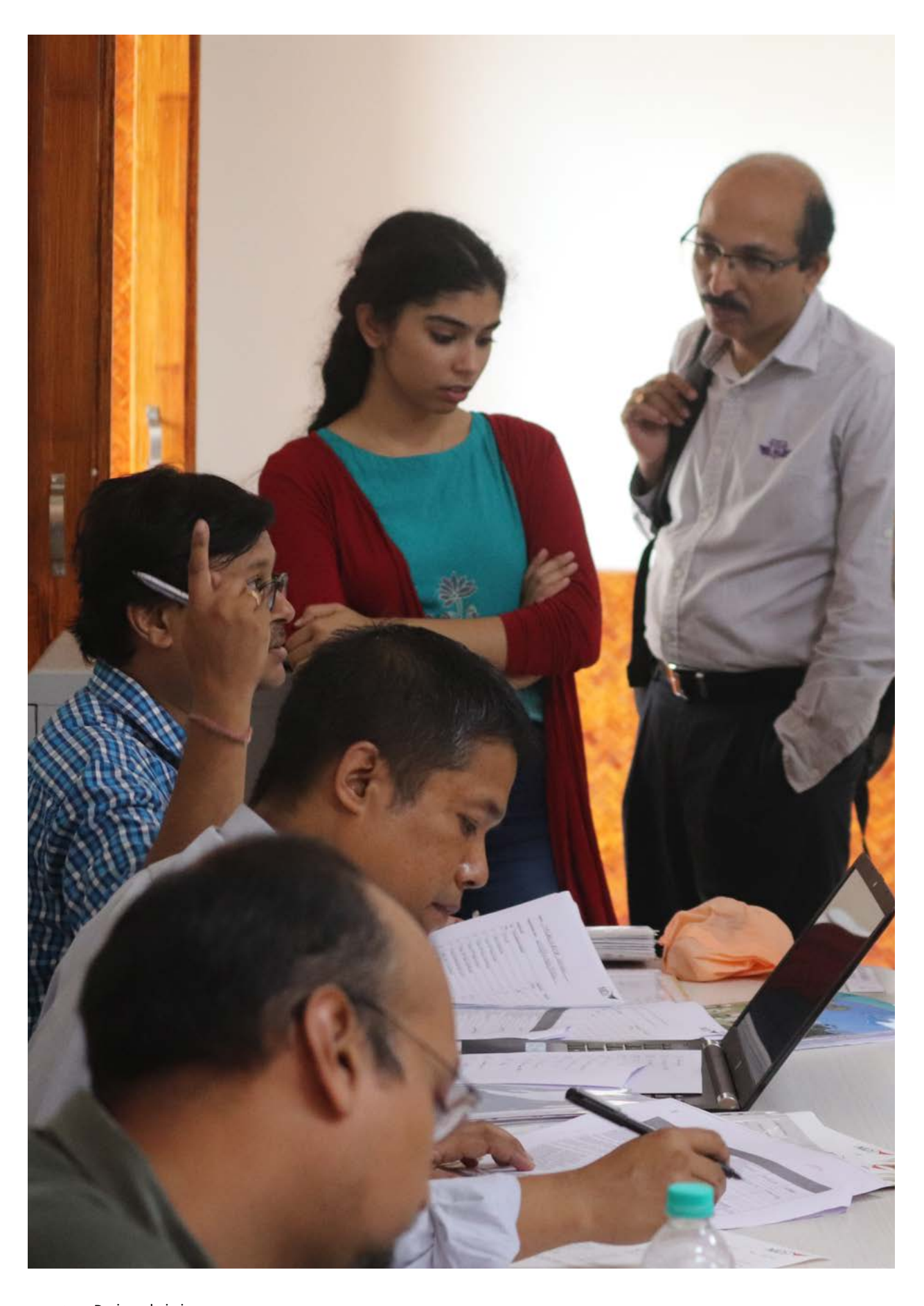
▲ ABOVE During admission process at NID, Assam, 2019