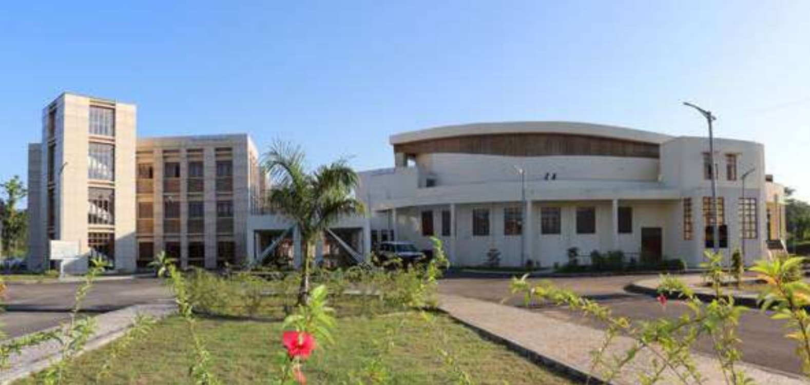
ABOVE A panoramic view of National Institute of Design, Assam campus.