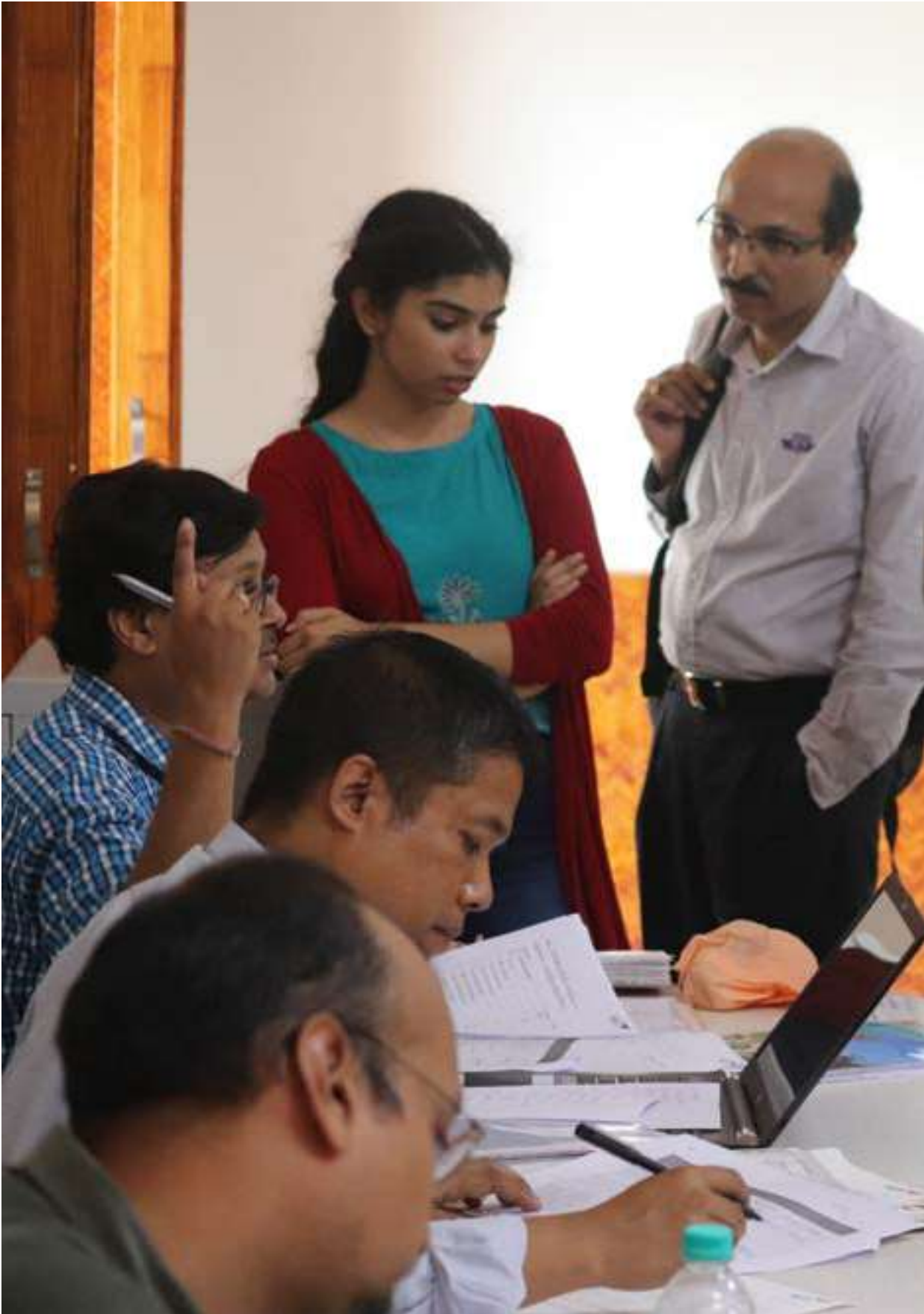
▲ ABOVE During admission process at NID, Assam, 2019