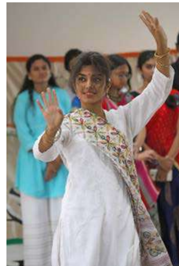
Faculty and Students participating in Independence day celebration at NID, Assam.