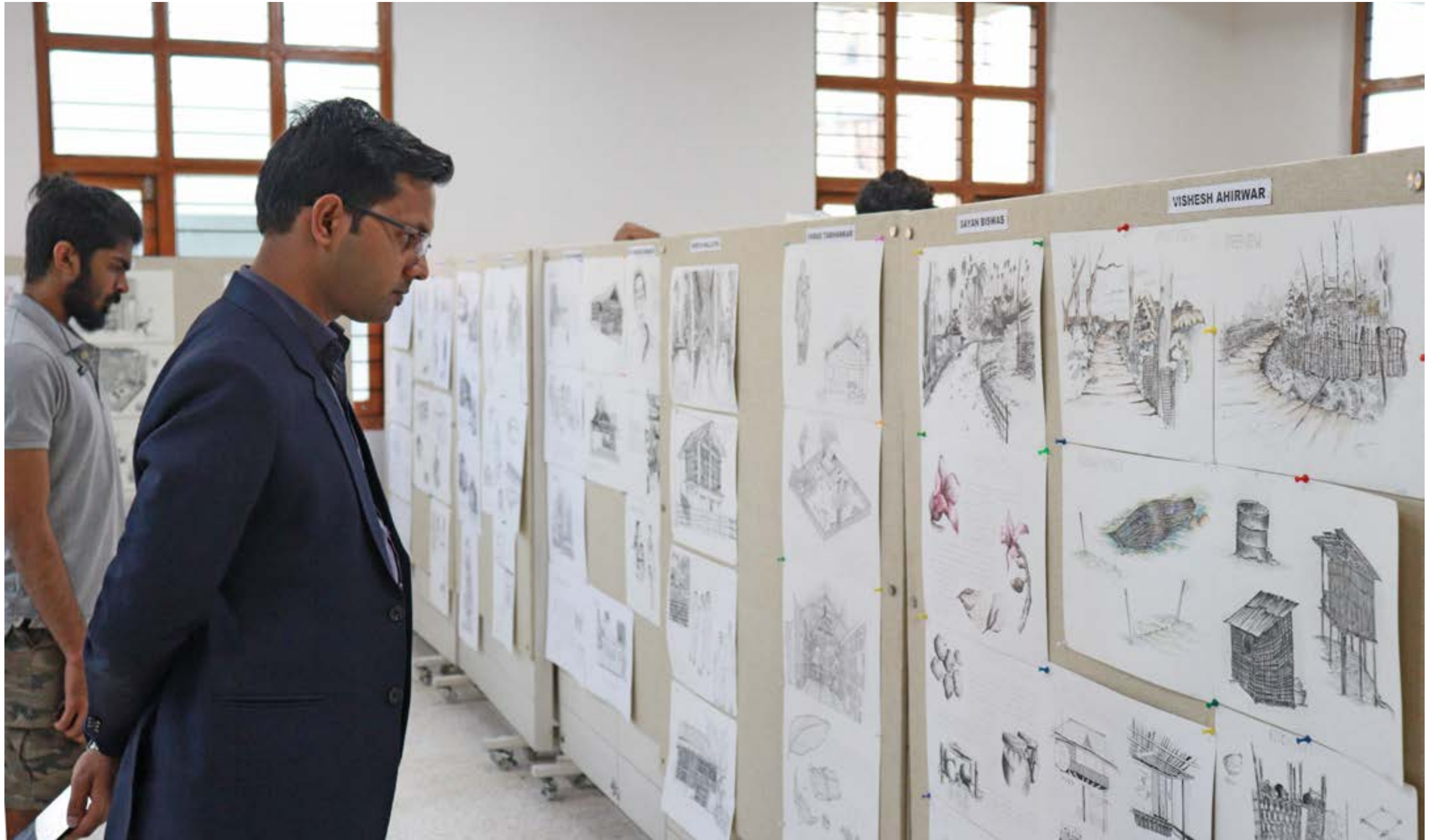
▲ ABOVE Student's works exhibition at display room.