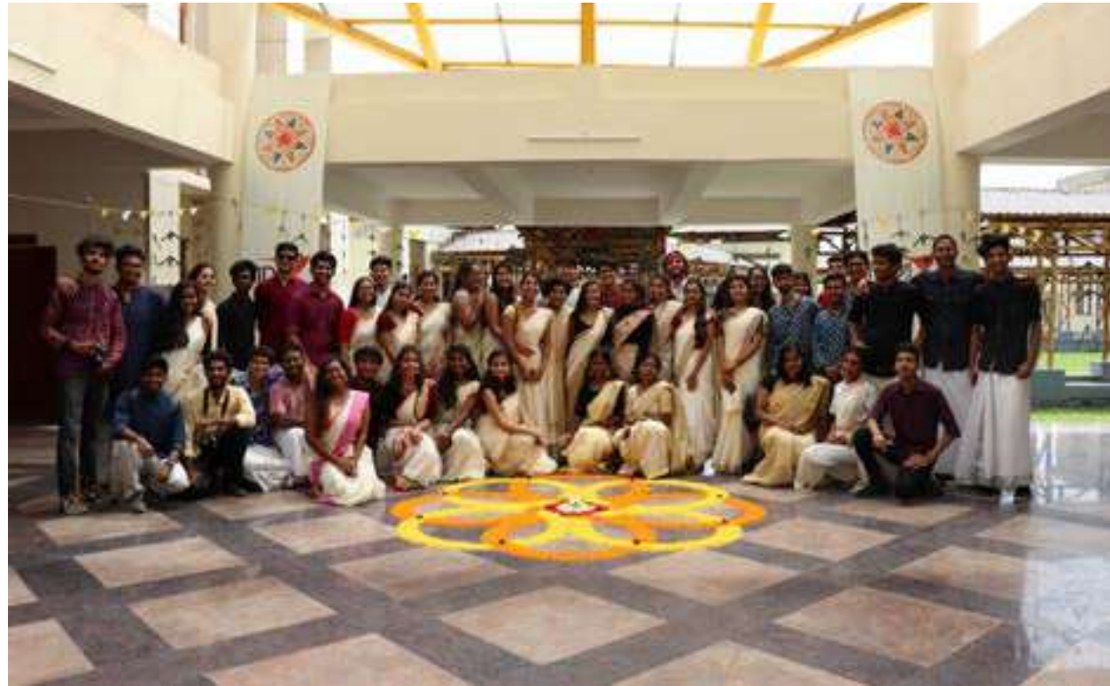
Onam Celebration 2019