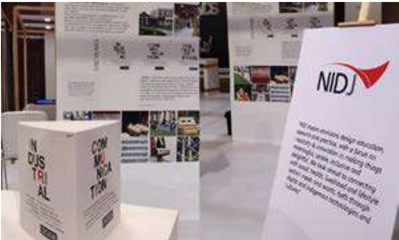
NID, Assam participated at World Design Organization (WDO) Hyderabad in October 2019