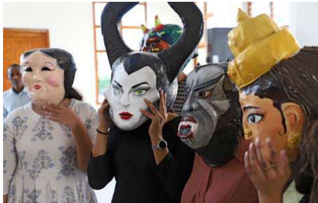
October 2019, Design week was organized at NID, Assam with fruitful outcomes.