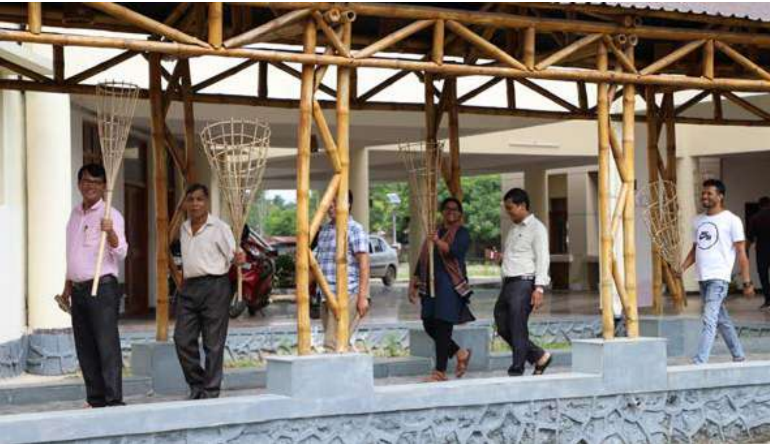
As a part of Gandhi Jayanti, putting Bamboo dustbin around the NID, Assam campus.