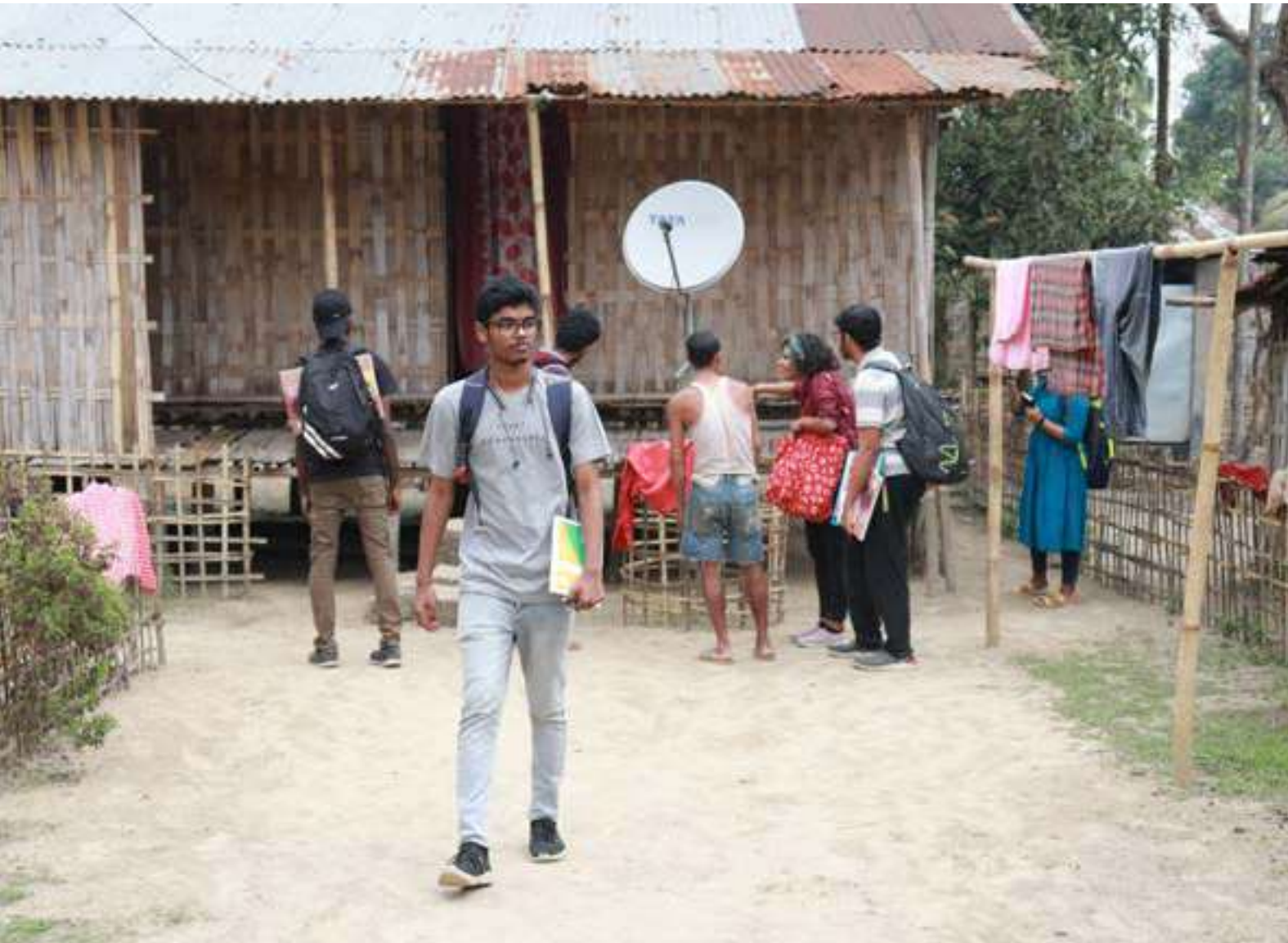
▲ ABOVE Students on their way to their designated sites of study and exploration. Course: Environmental Perception.

D esign is a creative, analytical and a holistic human centric process leading to a meaningful and desirable outcome. Design learning is a hands-on, minds-on engagement—experiential, reflective and developing objective and subjective sensibilities.