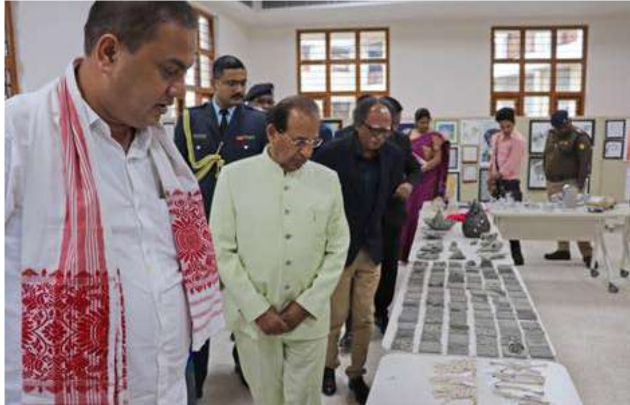
His Excellency Professor Jagdish Mukhi, the Hon'ble Governor of Assam visited the Institute and its facilities on 25th February, 2020 and interacted with Director, Faculty and Senior Staff Members.

His Excellency Professor Jagdish Mukhi, the Hon'ble Governor of Assam